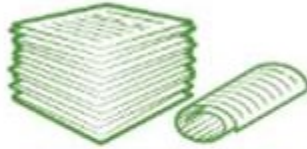
Magazines, Catalogs & Junk Mail Revistas, Catálogos y Correo Basura